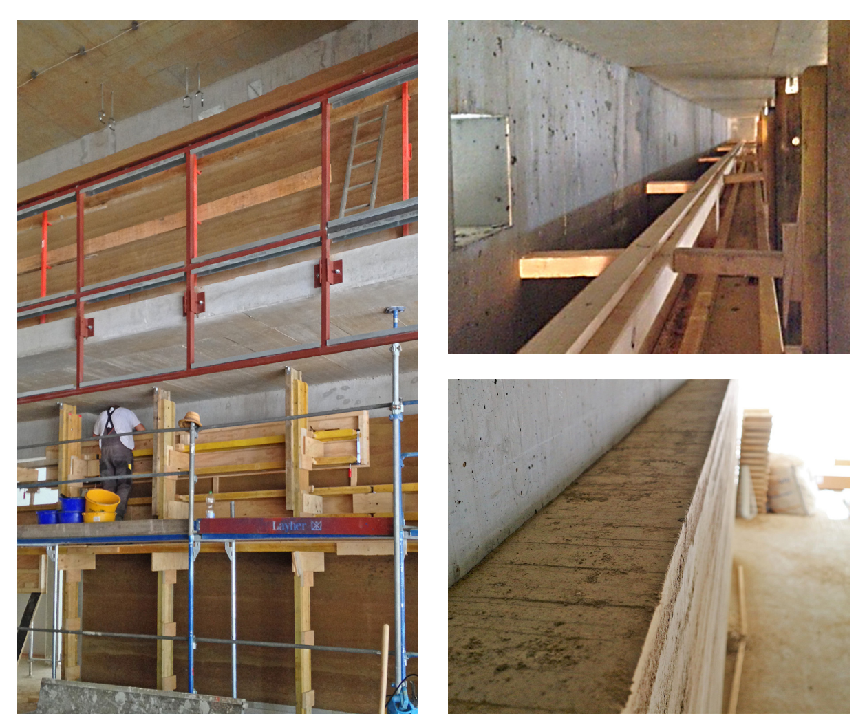
07-09 The construction process showing the travelling formwork principle