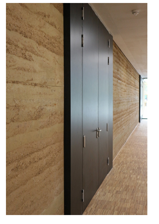
10-11 The finished result: ground floor (left), upper floor (right)