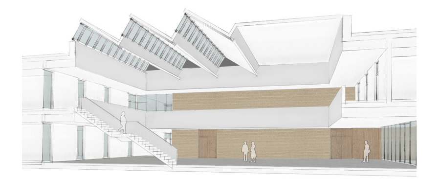
02 Drawings of the foyer (agn Niederberghaus & Partner GmbH)