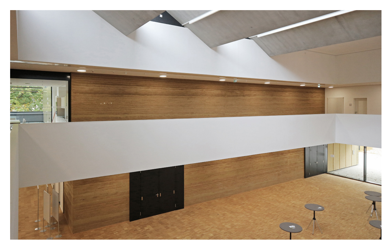
12 Foyer and main entrance