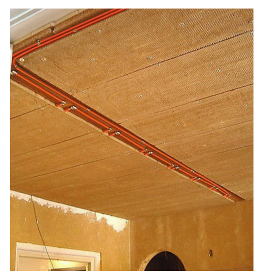
10 Ceiling-mounted WEM climate panels in a modern timber house in northern Italy (2005)

Climate panels made of earth are sustainable to produce and operate and thus contribute to climate protection. The use of earth building materials to regulate indoor climate opens up a previously unused sector for earth building with enormous potential.