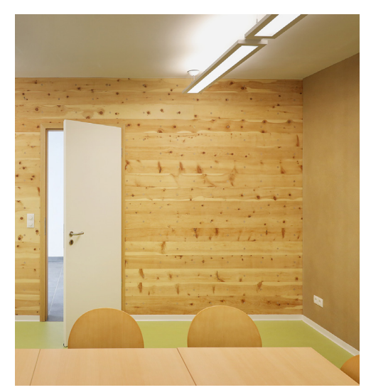
03 WEM climate panel ceiling made of earth for heating and cooling combined with Holz100 timber walling in the conference room.

Unlike conventional drywall materials, the heavier mass of earth building materials affords greater thermal comfort and has, in comparison, a better heating or cooling capacity than other commonly used building materials. In contrast to conventional air conditioning systems, radiant heating or cooling systems, whether installed in the walls or ceiling, operate noiselessly and without creating air flows and draughts. Earth building materials have a high drying capacity and can absorb small amounts of condensate when cooling and release it again as humidity levels change. The energy consumption of radiant