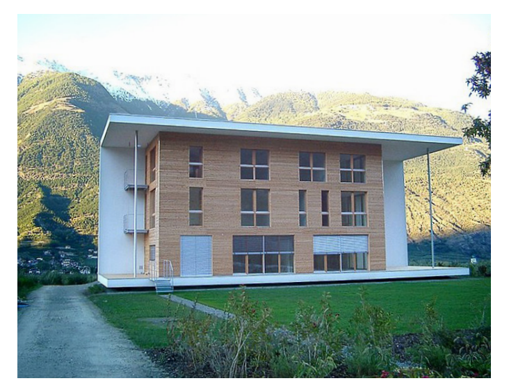
09 Modern house in north Italy (2012) – for summer cooling, the water for the climate panels passes through a ground collector