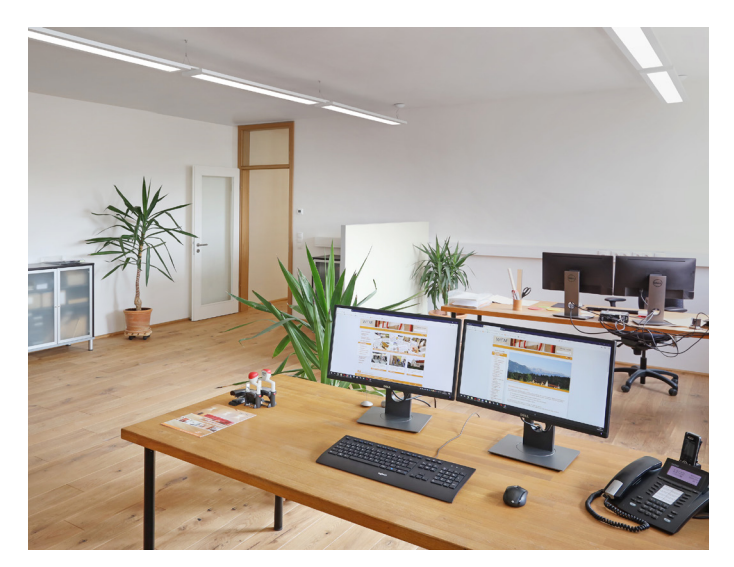
02 The heating and cooling climate panels in the office ensure pleasant working conditions all year round

It is here that earth building materials can contribute through their unique climate regulating properties.