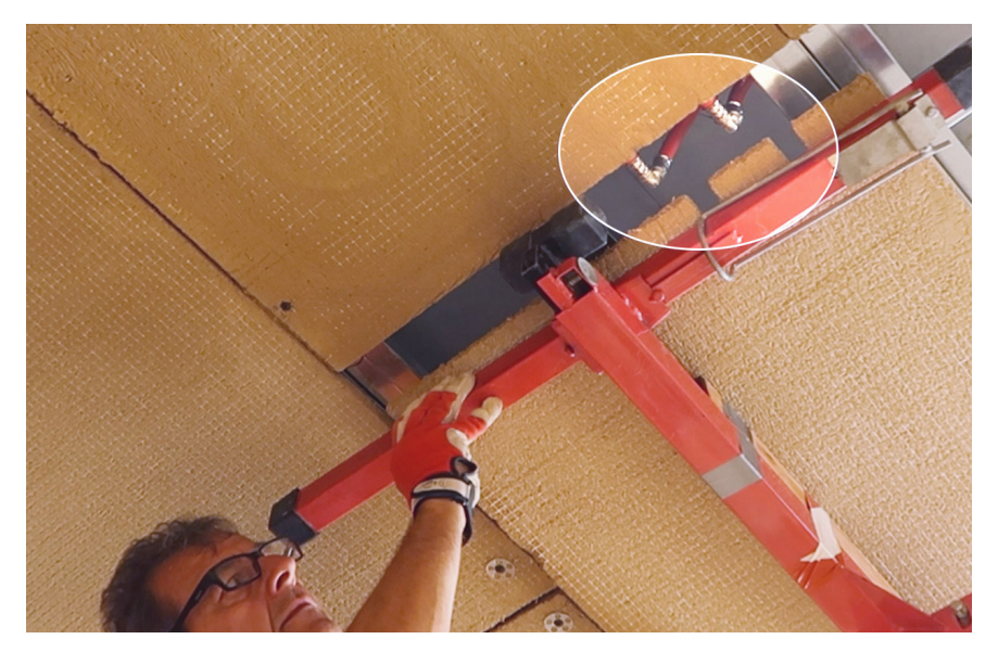
06 Pre-cut earth panels accommodate the pipe connections of the adjacent WEM climate panel to provide a flat, continuous surface for subsequent plastering