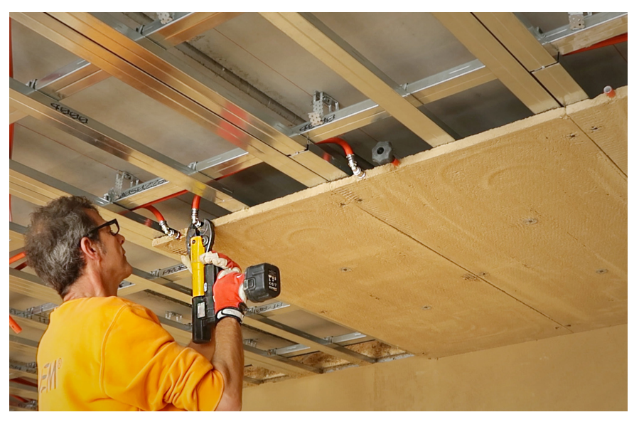
07 The climate panel elements are screwed to the suspended ceiling and the pipes linked together via compression-fitted connecting pieces