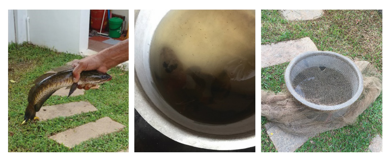
04 The snakehead murrel and the slime it secretes into the water

as a binding material and can be used to reduce soil shrinkage, eliminating cracking and improving the ability of the soil to withstand erosion [4].