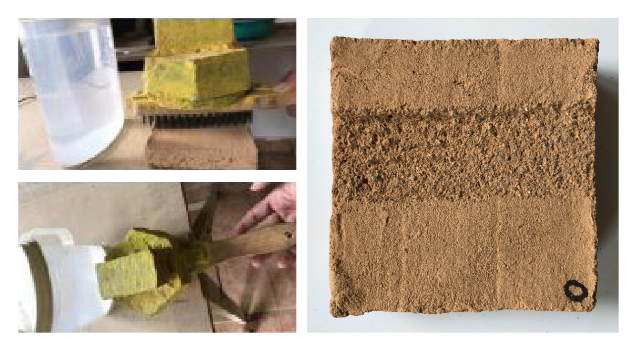
08 Abrasion test

sistency for plastering was kept constant for all the testing samples. All the samples were made using a mould 10 \times 10 \times 2 cm and were dried in a hot air oven at low temperatures between 50-100°C. The temperature and relative humidity during preparation of the mixes was on average 28°C and 80% RH.