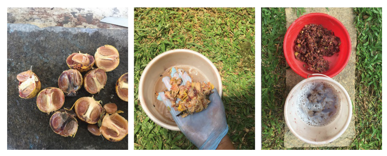
06 Process of extraction - Panachikaya

(the chemical composition is a hypothesis based on the presence of amino acids and needs scientific verification). Proteins react strongly with clays as the clay absorbs the hydrophilic particles so that the hydrophobic particles are concentrated near the surface of the plaster making it more water resistant [2 p.30].